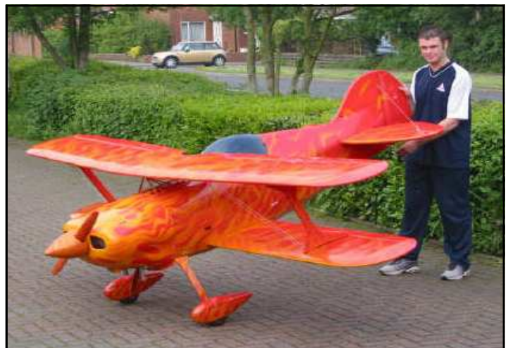
50% Pitts with a ZDZ 210 CC Don't ya love the paint job!