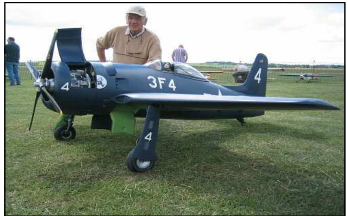
From the Netherlands with a variable pitch prop.