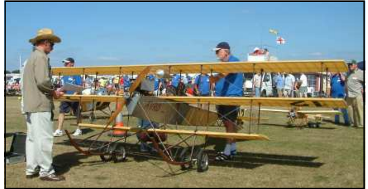
Big Plane from somewhere in England...pretty cool!

Don't recognize any of the planes or people below.....??? That's because these pictures were sent via email and are from England and the Netherlands.