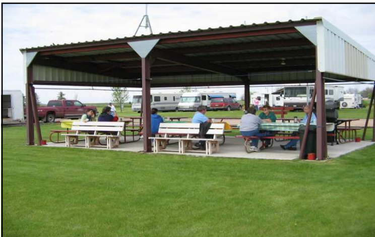
MAM members enjoying a beautiful day at the fly-