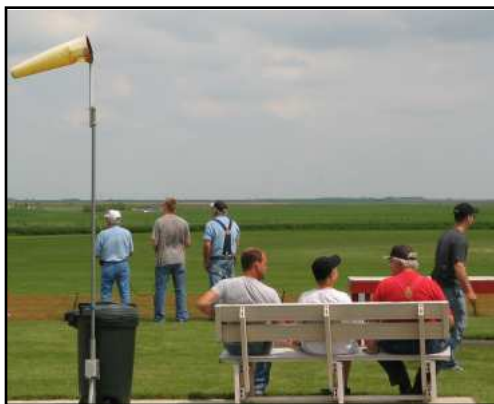
Someone reported that this was the most work these guys have done in a long time.....