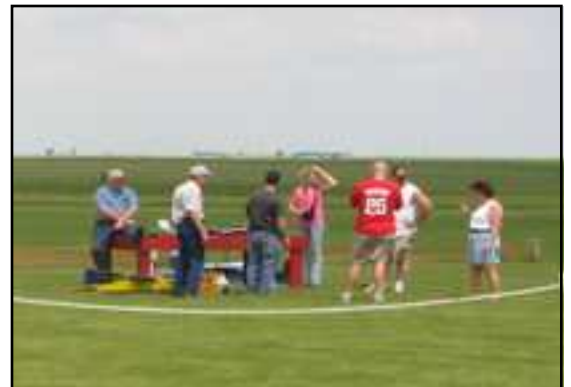
Having a good time at the Open House.....