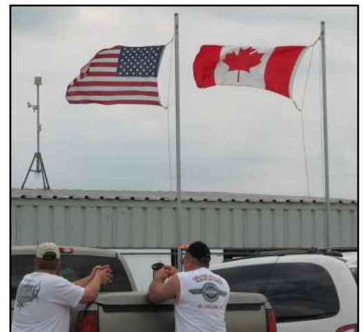
Looks like they were praying for the wind to calm down.....check out the flags!